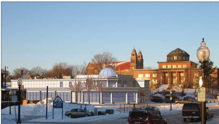
CONCEPTUAL IMAGE OF THE FUTURE MUSEUM BY BARRY POLZIN, ARCHITECT